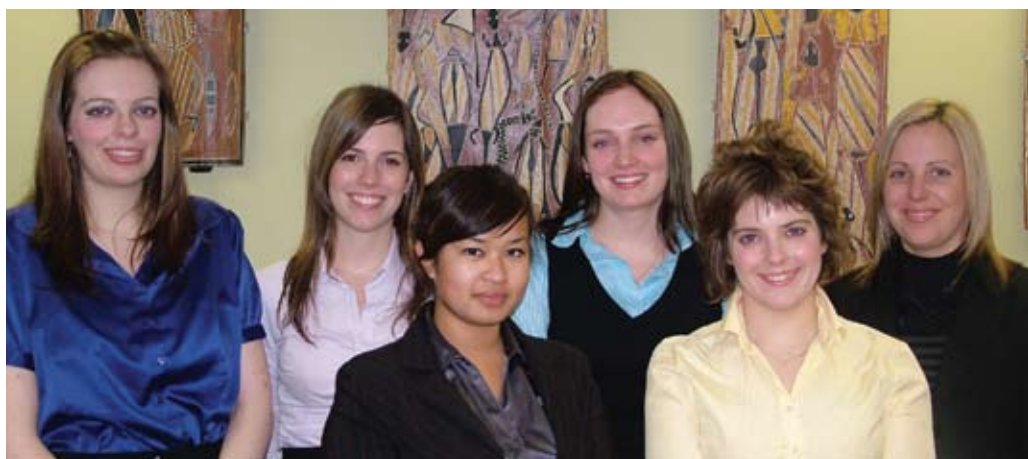
The 2008 young employees advisory group

The Court is not aware of anything similar in other Australian public sector organisations and hopes the YEAG's success will prompt other organisations to consider setting up similar initiatives.